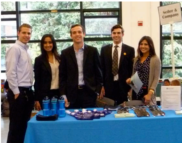
2012 UCSC Alums representing their CPA firm at the Meet the Firms event